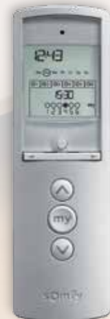
6 Channel remote with timer